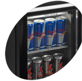
Designed for Energy-cans